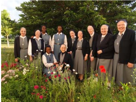
The Holy Family Contemplative community of